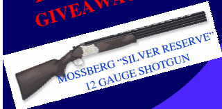
MOSSBERG "SILVER RESERVE" 12 GAUGE SHOTGUN