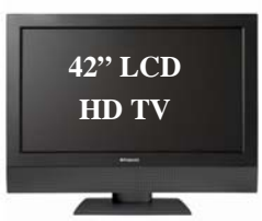
42" LCD HD TV

The winning water will then compete against finalists from 49 other states at the NRWA Annual Water Rally in Washington, D.C April 19-21st.